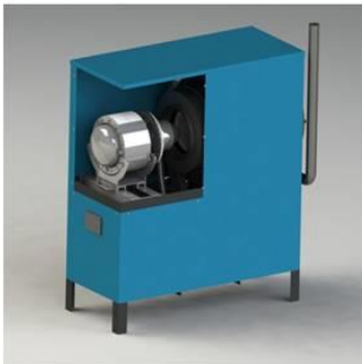
Rendering application with cladding